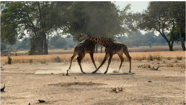
Anonymous, 2 Giraffes

In conclusion, America’s outlook on foreign policy will see big changes undertheupcomingTrumpadministration. Despite the congratulations, reports suggest major allies are concerned about Trump’s win. Donald Trump on the campaign trail threatened to impose new tariffs on nations such as Canada, Mexico, and China. In addition to tariffs, he claimed that he would resolve the war in Ukraine in a swift manner, while rethinking “NATO’s purpose and NATO’s mission.” These statements on foreign policy coupled with the reactions from world leaders only raise questions on what the next 4 years will hold. As a nation, we’ll have to wait and see.