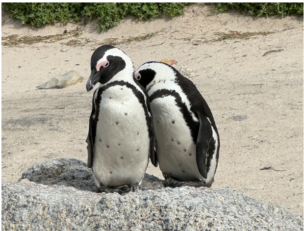
Anonymous, 2 Penguins

Haiti's path to peace is difficult but possible. Addressing political instability, insecurity, economic struggles, and social divisions will require coordinated efforts from Haitian leaders and the global community. By focusing on stable governance, improved security, economic growth, and social unity, Haiti can move toward a brighter and more peaceful future.